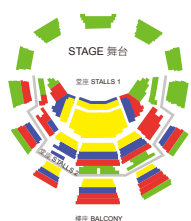
香港文化中心音樂廳 Hong Kong Cultural Centre Concert Hall